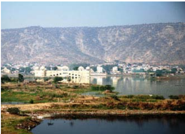
Man Sagar Lake, Jaipur.