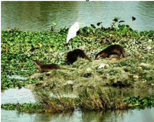
Smooth-coated Otter , Lutrogale perspicillata .

As dark fell we went torching around the grounds and were entertained by numerous Fireflies twinkling in the darker corners.