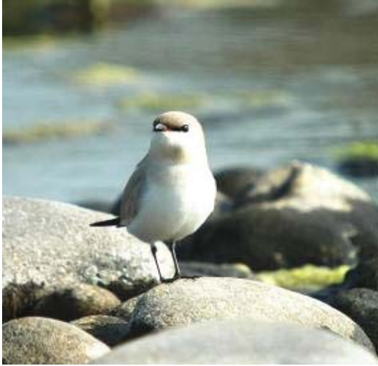
Small Pratincole , Glareola lactea .

We immediately set off with a new guide and driver down to the Giaborolli River, which we crossed in a small boat. On the far bank was a large sandy area strewn with grey boulders among which were around two hundred Small Pratincoles , and at the back twenty five Asiatic Wild Buffalo. On the river we saw two Ruddy Shelduck, four River Terns and a River Lapwing . A ranger station stood on the bank above the beach and in a tall tree above it a Peregrine Falcon was perched giving excellent views.