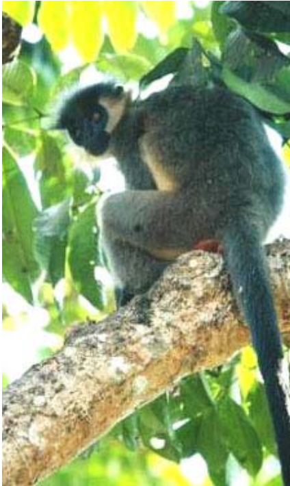
Capped Langur , Trachypithecus pileatus .

Blue-throated Barbet Common Mynah Oriental Magpie-Robin Hoary-bellied Himalayan Squirrel