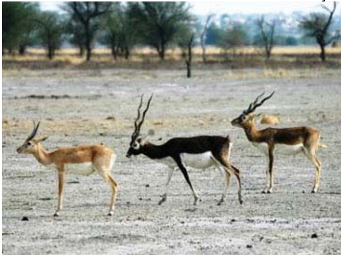
Blackbucks at Tal Chapar Reserve.