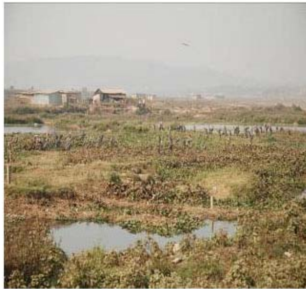
Greater Adjutant Stork Wetland adjacent to the dump

We then went up the road towards Kaziranga and stopped at an airy, straw-roofed café for a meal and coffee. It took more than an hour of bumpy, uncomfortable driving to cover the 20km to the café, due to the old road being demolished and the new road not yet being completed. At the café we noted that the people, buildings and vegetation were typical of the Indo-Malay region, rather than the rest of Indian sub-continent. And this was proven when we saw three Oriental Magpie Robins flitting around the café. We then continued along the awful road for three more hours until nearer Kaziranga it turned into regular tarmac and after another hour and a half we arrived after dark at the excellent Wild Grass Resort near the Kaziranga Nature Reserve main entrance. In future years, the new road will make this a far quicker journey.