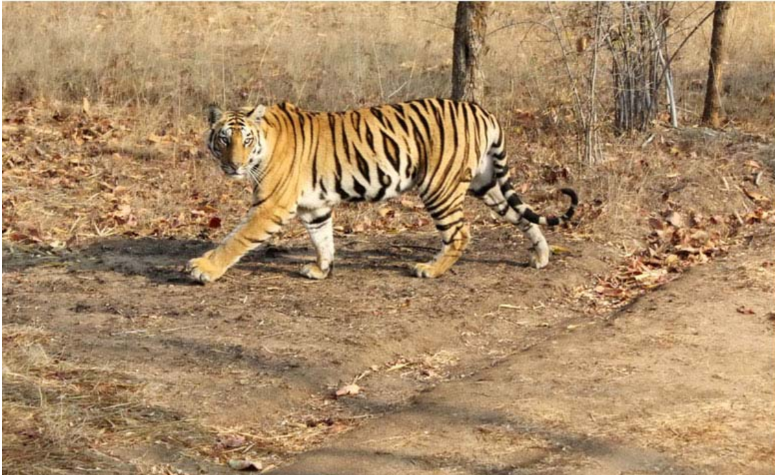
Our final close encounter with this female tiger in Bandhavgarh National Park.