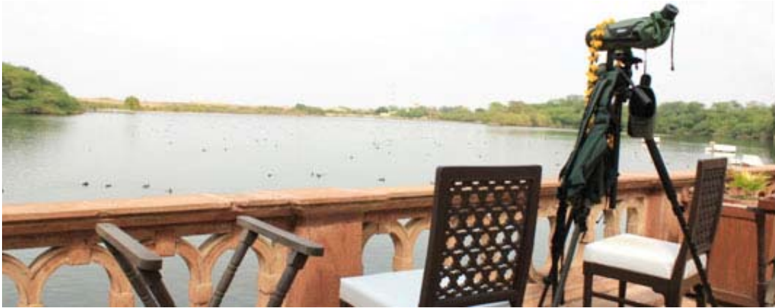
Gajner Palace Heritage Hotel overlooking a superb lake.